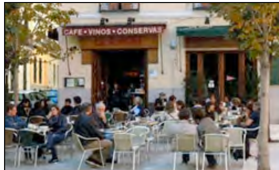
Bar Museo Platerías