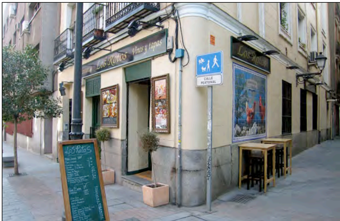
Los Rotos, C/Huertas, 74

Dining near Hotel Palacio San Martín: Cornucopia, Anema e Core, El Cucurucho del Mar, Chocolatería Valor and Chic Madrid.