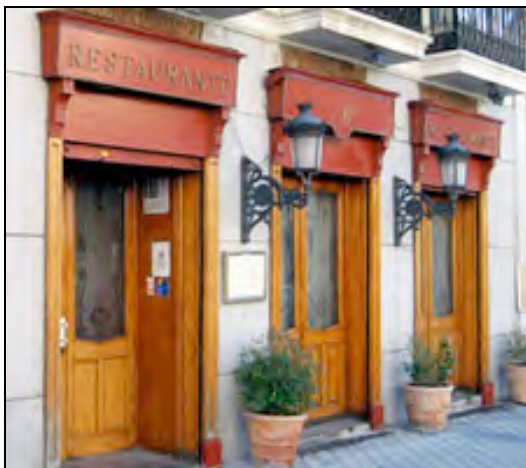
Restaurante Balzac, Moreto, 7, behind the Prado

Dining near the AC Palacio del Retiro: Nicolás, Dassa Bassa, Ramsés, Le Dragon, La Cesta de Recoletos, Kabuki Wellington, Goizeko Wellington (Basque), Harina (breakfast & tea), Horcher (3 Repsol suns), Viridiana, Asador Frontón III (steaks), Harina (breakfast & tea), and Balzac.