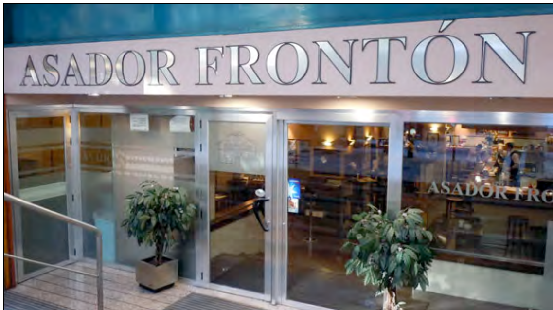
Asador Frontón, Calle de Pedro Muguruza, 8

Dining near the Hotel Adler: Loft 39, D'E (tapas), El Rincón de Goya (tapas), La Trainera (seafood), Teatríz, Lago de Sanabria, Asador Frontón (steak) plus all the dining spots on Jorge Juan.