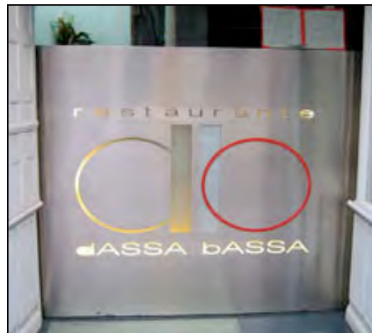
Dassa Bassa, Villalar, 7