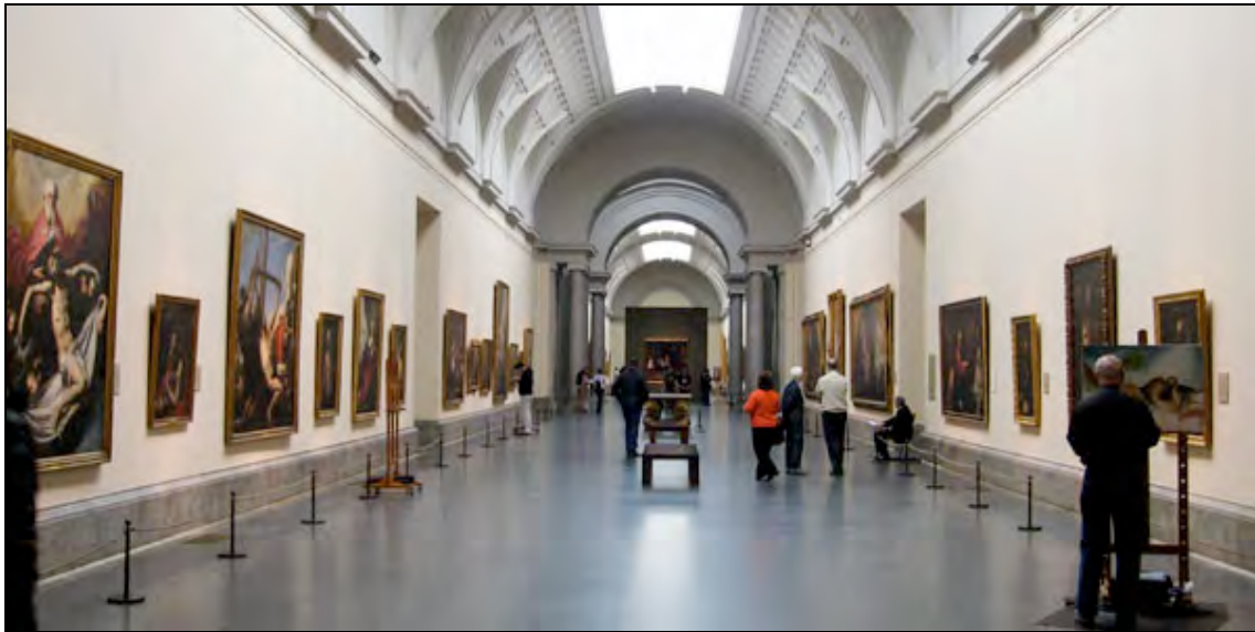
Inside the Prado Museum