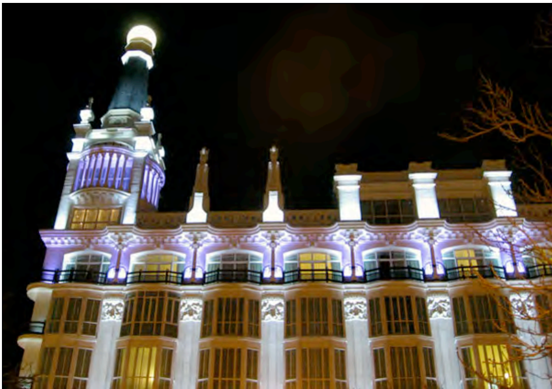
Hotel ME in the Plaza Santa Ana at midnight

Dining near the Hotel Urban: Asia Gallery at the Palace, Goya at the Ritz, Midnight Rose at the ME, Viridiana, Paradis Madrid, Cerveceria Cervantes, Taberna de la Daniela, Lateral, La Bardemcilla de Santa Ana, Cerveceria Alemana, Lhardy, Olsen and Estado Puro.