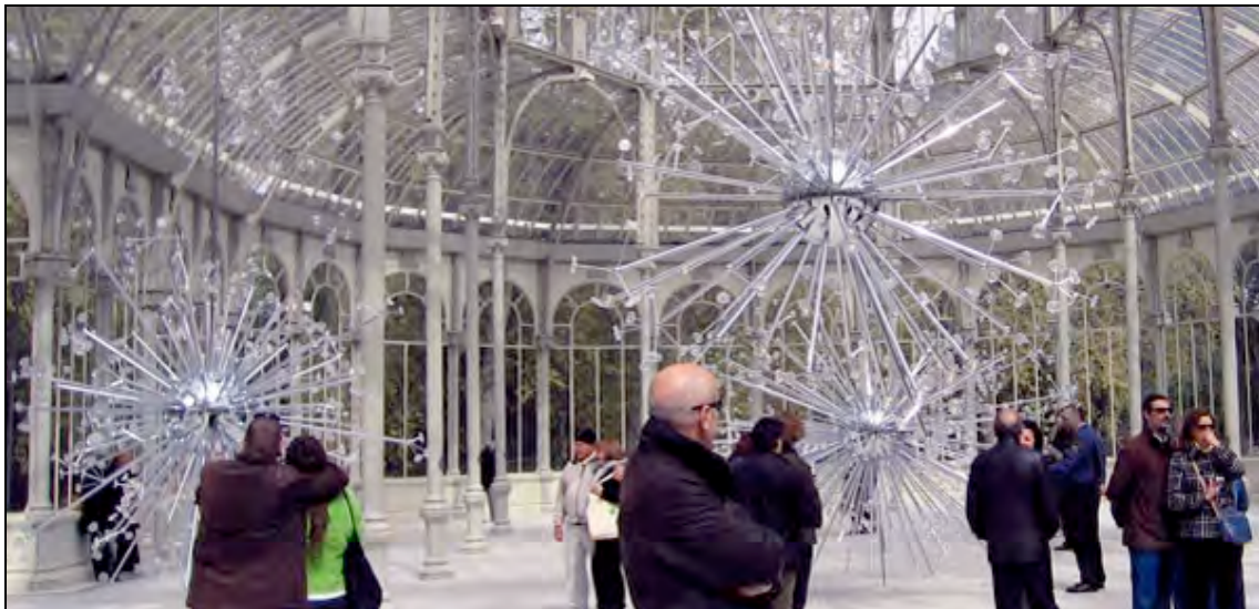
Inside the Crystal Palace, Retiro Park

Dining near the Wellington: La Fonda (catalán), Pan de Lujo, Sula, El Paraguas, Zen Central, Alcalde, Vino Tinto, Iroco (brunch), La Colonial de Goya (evening tapas), El Chiscón de Castelló, La Cesta de Recoletos, Dassa Basa, Nicolás and Le Dragon.