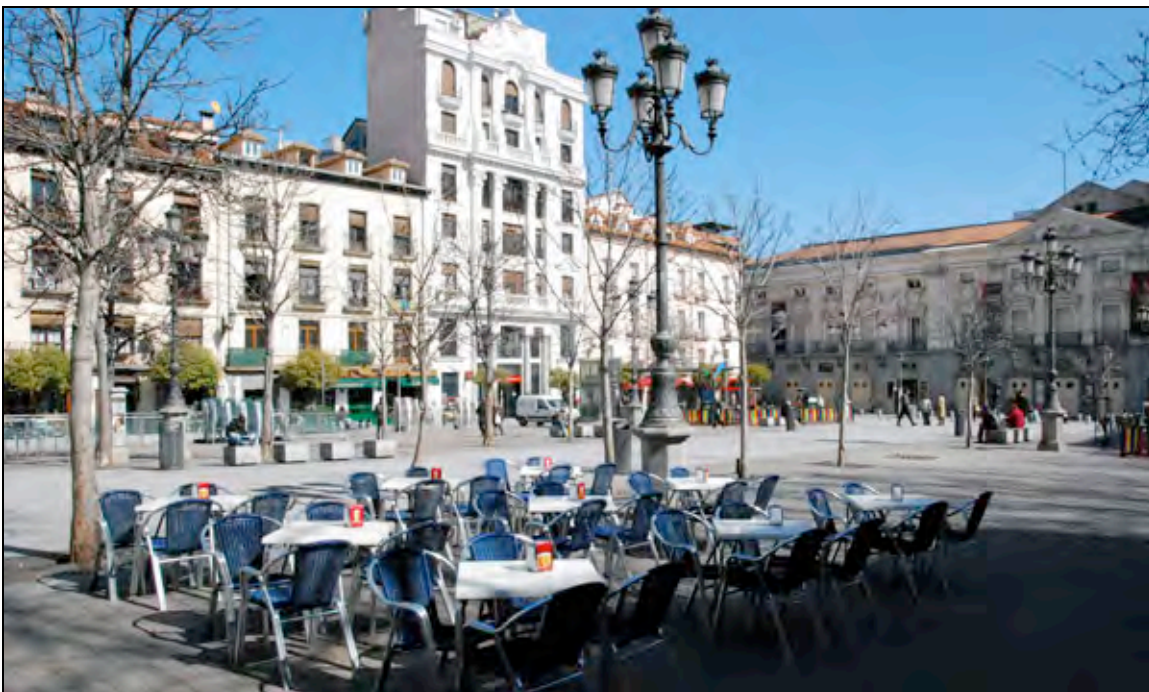
Plaza Santa Ana