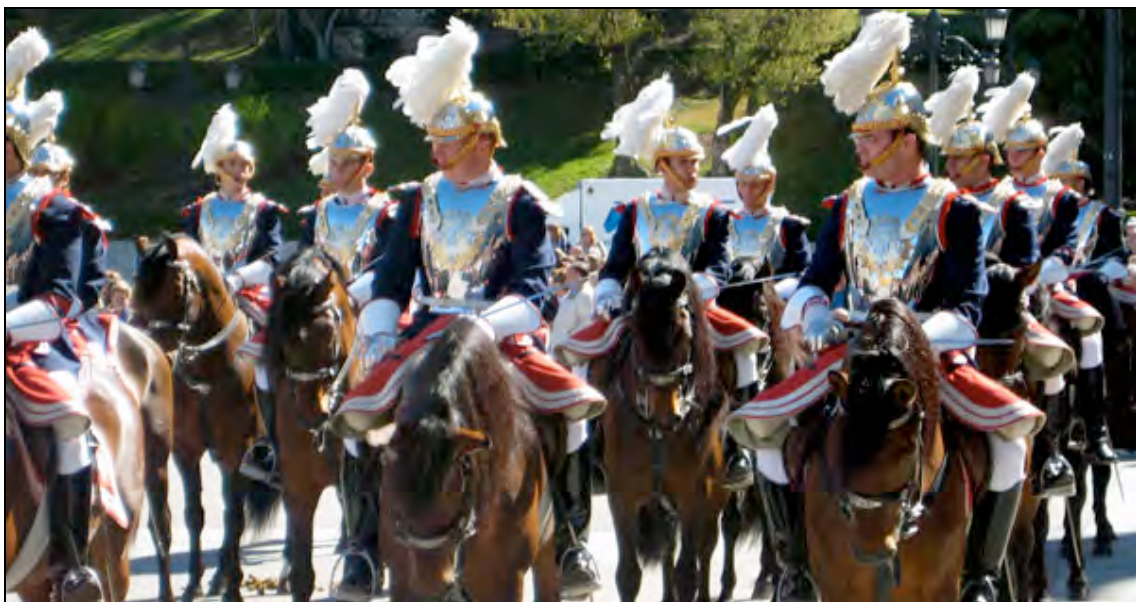
The Changing of the Guard at the Royal Palace

Dining near Casa de Madrid - Chic Madrid, La Bola (cocido), El Mollete, Taberna del Alabardero, Café del Oriente, Anema e Core, Genoveva de Bari, Taberneros and Gastroteca de Santiago.