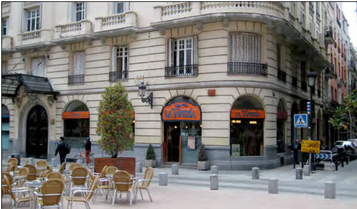
La Tapería de Prado, Paseo del Prado, 22

Dining near Hotel Vincci SoHo: Olsen, La Mucca, El Lateral, Cervecería Alemana, Cervecería Cervantes, La Taberna de la Daniela, Prada a Tope, Per Bacco (pizza), Le Petit Bistro, Midnight Rose, Artemisa (vegetarian), La Bardemcilla de Santa Ana, Vinoteca Barbechera, Come Prima, East 47 at the Derby Villa Real, Estado Puro, Domine Cabra, and Maceiras.